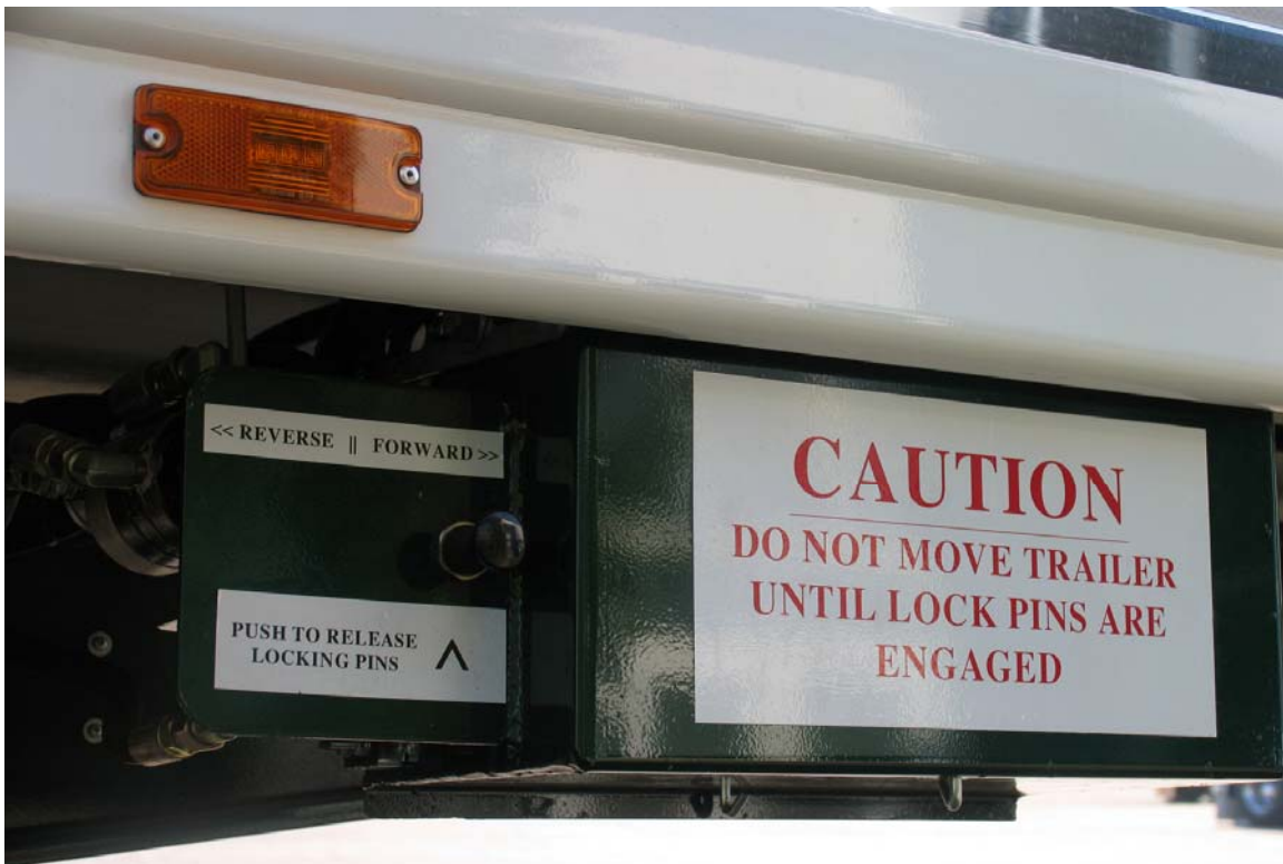
Safe 'n Easy: the Advance lead roll back operating device.