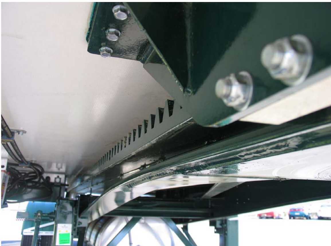
Take a closer look: the roll back rack and pinion device.