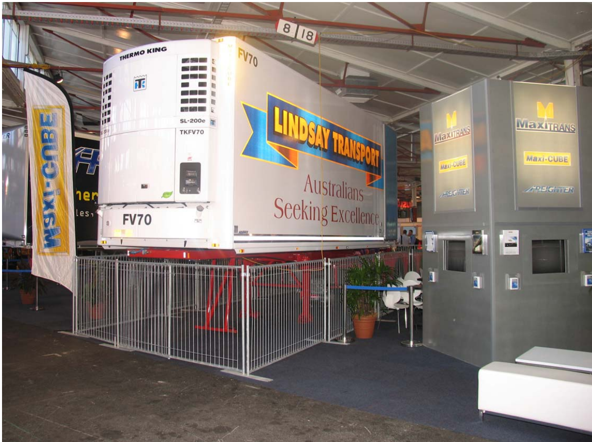
The new Maxi-CUBE Advance rollback system was demonstrated for all to see at the Maxi-CUBE stand.