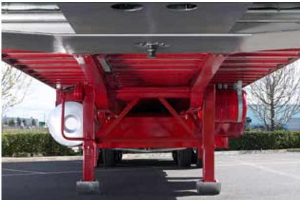
Full length steel chassis to skid plate.