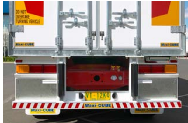
Optional provision for road train coupling.